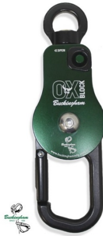
OX HOOK™ – 2406S