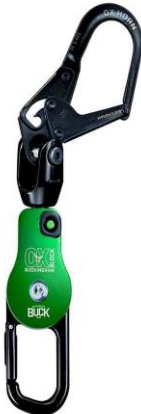
Ox Block 50062D with Ox Horn Hook 2406S