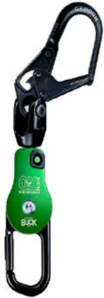
Ox Block 50062D with Ox Horn Hook 2406S